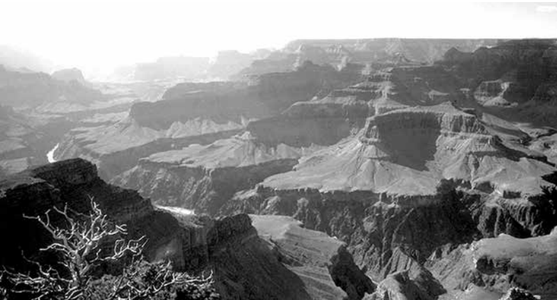
If ‘Lucifer’s flood’ created this, then what did Noah’s Flood do?