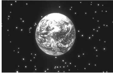
God created everything in six days. (Exodus 20:8–11)

form and void’ must mean ‘laid waste by a judgment’—so that use of these words in Genesis 1:2 must mean that Earth suffered a judgment. But this is fallacious—there is nothing in the Hebrew words tohu va bohu themselves to suggest that. The only reason they refer to being ‘laid waste’ is due to the context in which the phrase is found in Jeremiah 4. The words simply mean ‘unformed and unfilled’. This state can be due either to nothing else having been created or some created things having been removed. The context of Jeremiah 4 is a prophecy of the Babylonians attacking Jerusalem, not creation. In fact, Jeremiah 4:23 is known as a literary allusion to Genesis 1:2—the judgment would be so severe that it would leave the final state as empty as the earth before God formed and filled it.