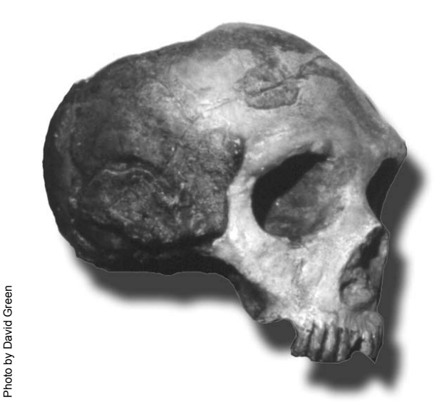
The Neandertal Gibraltar 1 cranium was found in Forbes' Quarry, Gibraltar prior to 1848, and is dated somewhere between 45,000 and 70,000 years ago. It is said to be the first adult Neandertal cranium discovered, but was not recognized as such until after the discovery of the original Neandertal fossils in the Feldhofer cave, Germany in 1856.

the discussion moves on to the next group of fossil humans, the following comment from evolutionist Harry Shapiro is very revealing: