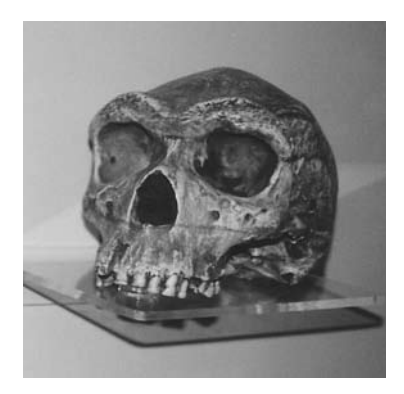
The Broken Hill cranium from Kabwe, Zambia is classified by most evolutionists as belonging to Homo heidelbergensis. The photo was taken at the San Diego Museum of Man.

Skulls classified as erectus are considered by evolutionists to exhibit key characteristics that differentiate them from modern humans. Key characteristics include: prominent browridges; insignificant chin; large mandible; forwardly projecting jaws; a flat, receding forehead; a long and low-vaulted cranium; occipital torus; relatively large teeth; relatively large facial skeleton; and a thick-walled braincase.<sup>77</sup> A major problem for evolutionists is that many (if not all) of the above-mentioned features, which supposedly differentiate erectus from modern humans, also occur in