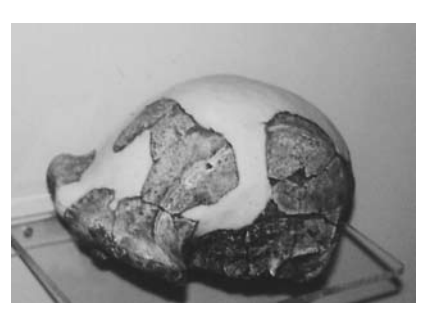
Louis Leakey found the Homo erectus cranium OH 9 in 1960 at Olduvai Gorge, Tanzania. It is dated to 1.2 Ma and has a cranial capacity of 1067 cm<sup>3</sup>. It has huge brow-ridges. CT scans of the bony labryrinth of the inner ear of this specimen indicate a modern human morphology, reflecting human locomotion. The photo was taken at the San Diego Museum of Man.

'So far as it has been possible to apply appropriate tests, there is within such limits no marked correlation between the brain size and intelligence. To the paleoanthropologist this lack of correlation is particularly disconcerting for it means that he has no sure method of assessing the