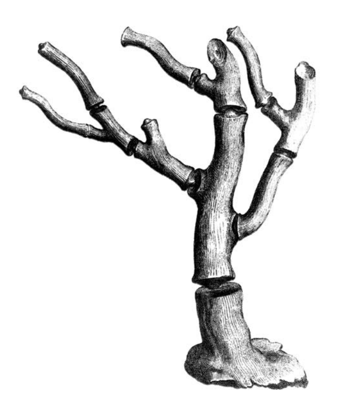
Figure 1. The late Stephen Jay Gould used Scilla's coral as an icon to illustrate the structure of Darwinian theory. The trunk represents natural selection.