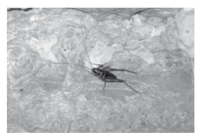
Figure 4. Cave cricket in Hamilton Cave. Notice the exceptionally long antennae.