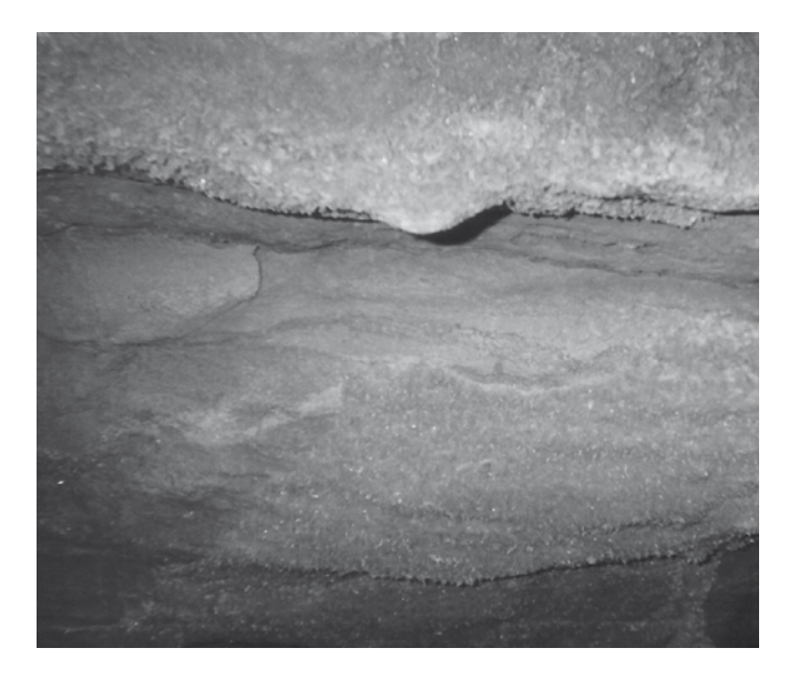
Figure 2. Gypsum crystals in Hamilton Cave.