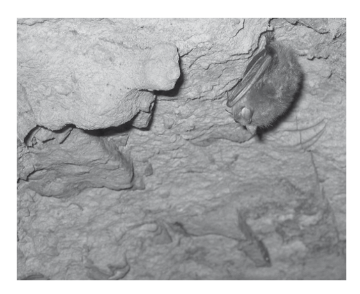
Figure 3. Bat hanging from ceiling in Hamilton Cave.