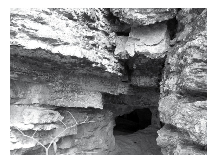
Figure 1. Entrance to Hamilton Cave, about 0.6 m high.

squirm through with great difficulty. It is a narrow, straight, horizontal tube 6.4 m long, aptly named 'The Airblower' since there is usually a current of air passing through it. Beyond the Airblower are more passageways which lead to the very large 'Bowl Room'. The cave ends with a few relatively short dead end passages extending beyond the Bowl Room. The total length of all the cave's passages is about 7.7 km. The maze section near the entrance makes this a cave in which it is easy to become lost. I strongly recommend that visitors to Hamilton Cave always be lead by experienced cavers who are familiar with this cave. If markers are used, they must be removed on the way out. In addition, cave exploration should always be done in groups of at least three and each person should have at least two backup sources of light, in addition to their main light source. Hamilton Cave has a variety of features. It has passageways with high ceilings and others where it is necessary to crawl. There are many formations, crystals (figure 2) and fossils which can be seen in this cave. In addition, bats (figure 3), millipedes, cave crickets (figure 4), cave rats, etc. have been observed there.