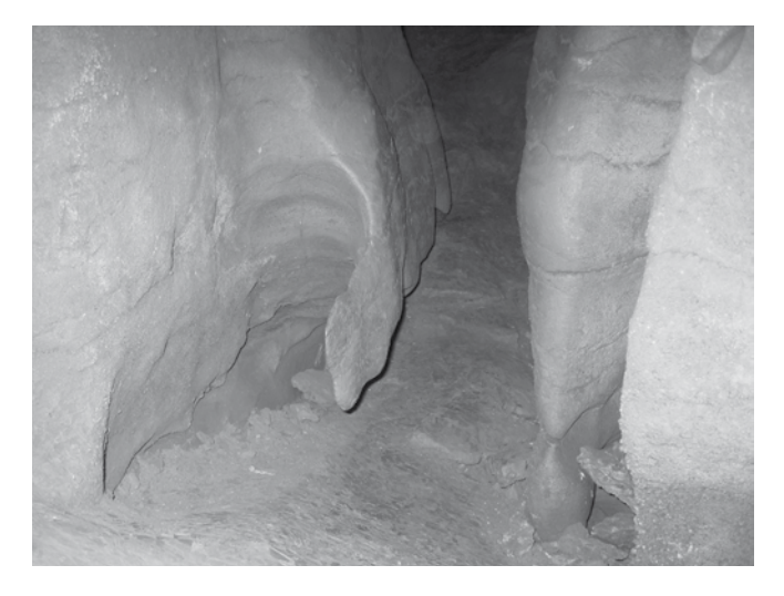
Figure 5. This smoothly-curved, cup-shaped wall pocket (number 5) in Hamilton Cave measures 46 cm wide and 57 cm deep.

Did the same water that sculpted these cave rock relief features also form the cave itself or were they sculpted after the cave was formed? In order for them to have been sculpted out of consolidated rock after the cave was formed, there would have needed to be a large volume of water available to move under great pressure. Could this water have come from the depths of the cave? According to the cave's map, the US Geological Survey map of the land above the cave and personal observations of the terminal region of the cave and the environs above the cave (and also personal conversation with one of the members of the first team to