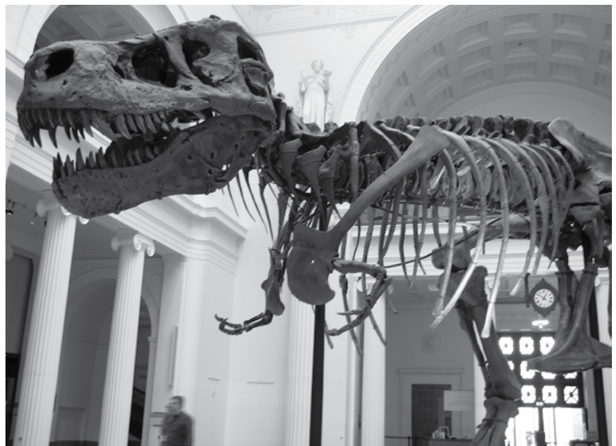
'Sue' the T. rex suffered from an array of injuries and diseases, a symbol of the suffering that pervades the fossil record. Kitcher points out that one of Darwin's major contributions was greatly enlarging the scale on which suffering took place in Earth history.

All of the arguments over the scientific matters are in some respects preliminary to Kitcher's reflections in the final chapter. Kitcher realizes that the creation-evolution debate is charged with implications for the most fundamental questions of the meaning of life. The debate will last as long as there is a conflict between Darwinism and biblical Christianity. Unlike so many leading evolutionary thinkers that have papered over the issue, 9 Kitcher acknowledges that there is a real conflict. In Kitcher's