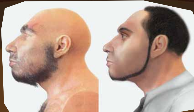
A 'Neanderthal' man

If you put a suit on them and gave them a shave you'd hardly notice them walking down the street!