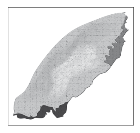
Figure 5. The Hahnöfersand frontal bone (side view) has some Neandertal features, including a receding forehead, and was considered to be from a hybrid between Neandertals and 'modern' humans by some evolutionists. (After Bräuer<sup>50</sup>)

and Neanderthaloid affinities' and that it 'is certainly difficult to state which affinities are dominant in this frontal'.<sup>40</sup> Bräuer suggested that Hahnöfersand and Neandertals may have gone through a 'hybridization phase' in Western Europe.<sup>41</sup>