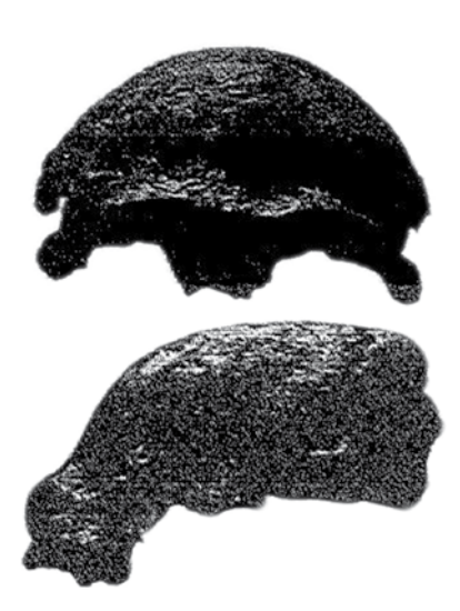
Figure 1. The Podkumok skull (top: frontal view; bottom: side view) has morphological affinities with the Neandertals, including a prominent continuous browridge and a receding forehead. (From Golomshtok,<sup>17</sup> Plate VII).

Why is the evolutionary age of the Podkumok skull