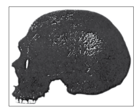
Figure 4. The Nowosiolka skull (side view) was reported to contain numerous characteristics only associated with Neanderthals, including a large browridge. (From Stolyhwo<sup>35</sup>).

Neandertals should be taken seriously. While the Nowosiolka skull may not have been a Neandertal proper, it appears to show enough Neandertaloid features to either classify as a hybrid or to illustrate that many Neandertal characteristics are within the range of modern humans.