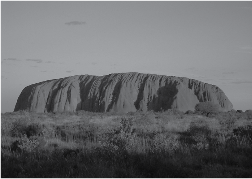
Uluru, also known as Ayers Rock, is a prominent Australian landform carved by receding floodwaters.

formation can be elegantly explained with reference to the last 150 days of the Genesis Flood. This period is referred to as the ‘Retreating’ or Recessive stage of the Flood.