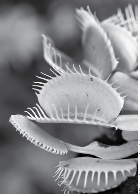
Figure 1. The Venus Flytrap has modified leaves that clasp the unwary insect, leading to its digestion by the plant.

Let us focus on some implications of the foregoing. Considering the relative phenotypic malleability of plants relative to animals, it would be interesting to determine experimentally if within-kind variation could transform an excrement-absorbing pitcher plant into an insect-eating one. If so, this could help to explain from a naturalistic viewpoint, how carnivorous plants have arisen since the Fall. This, of course, assumes that the death of insects, which probably have no concept of life and death, and are likely not nephesh chayyāh (נפש תיה = living souls/creatures), and which probably feel no pain, was inconsistent with a "very good" initial Creation.