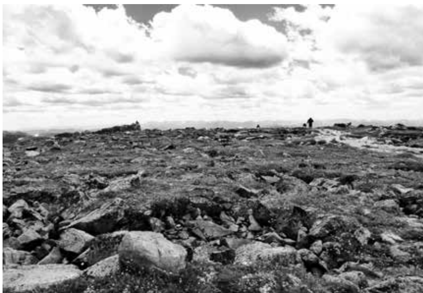
Figure 6. Blockfield on top of the glaciated Beartooth Mountains, north-central Wyoming and south-central Montana, USA

The origin of blockfields is somewhat of a mystery, especially since they are neither forming today nor did they form after the ice left, with the exception of limestone blocks in the Canadian Arctic. 27,34,35 Many researchers thought that blockfields formed before glaciation in a warm pre-Pleistocene climate. 36,37 However, the consensus has shifted to viewing them as a result of a cold environment associated