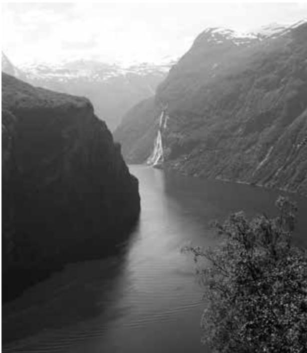
Figure 2. Geirangerfjord, Møre og Romsdal, Norway