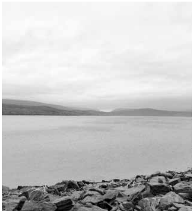
Figure 3. A piedmont lake in north-east Sweden along the east slopes of the divide