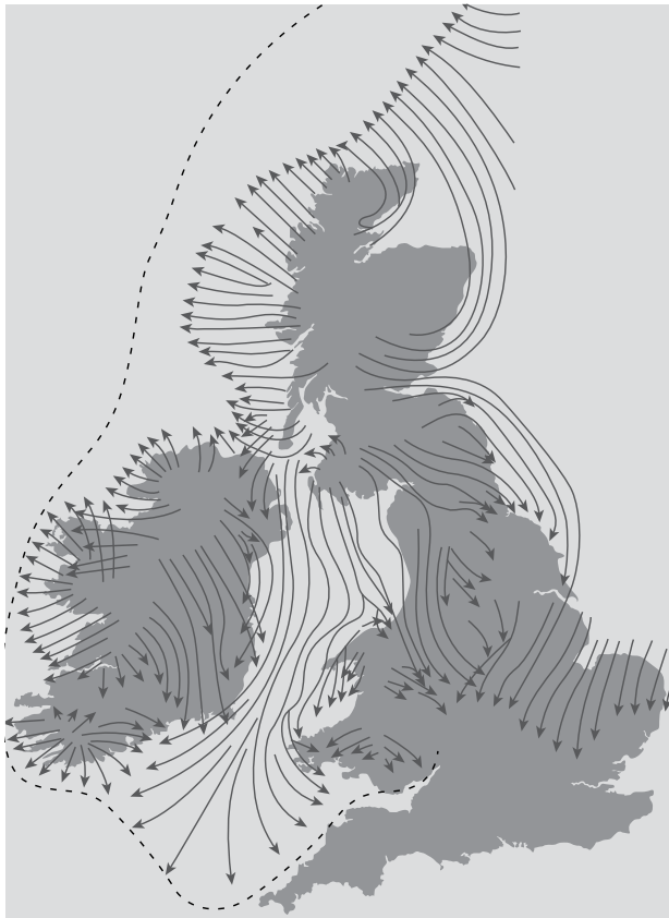
Figure 4. The British-Irish Ice Sheet with the generalized flow patterns (arrow) (from Hughes et al. 90 ). The dashed line is its maximum extent, which was the edge of the continental shelf in the west.

of ice streams (a glacier that moves more than 1 km/yr 18 ) commonly inferred for the ice sheets during the Ice Age. 19