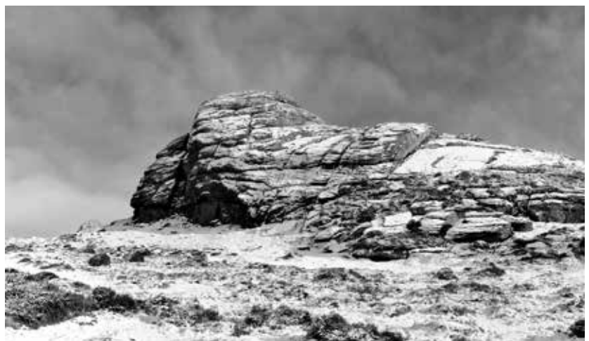
Figure 5. Hey Tor on unglaciated Dartmoor, south-west UK

A tor is “A high, isolated crag, pinnacle or rocky peak; or a pile of rocks much-jointed and usually granitic, exposed to intense weathering, and often assuming peculiar or fantastic shapes.” 26 Figure 5 shows a tor from non-glaciated Dartmoor, south-west UK. Tors are especially significant because they can be easily eroded by a glacier or ice sheet, and therefore are an indication that there was little erosion