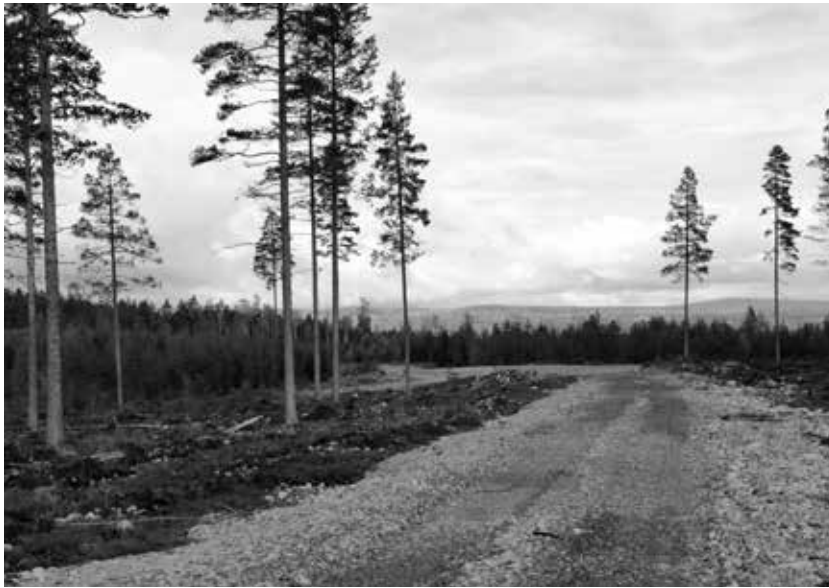
Figure 7. Planation surface with rounded inselbergs near Umeå, Sweden

northern and central Sweden, 9 glacial till is generally thin. 31 This is anomalous considering all the proposed glacial activity. The glacial transport of eroded rocks was also of short distances. 50 Indeed, Stroeven et al. exclaim: